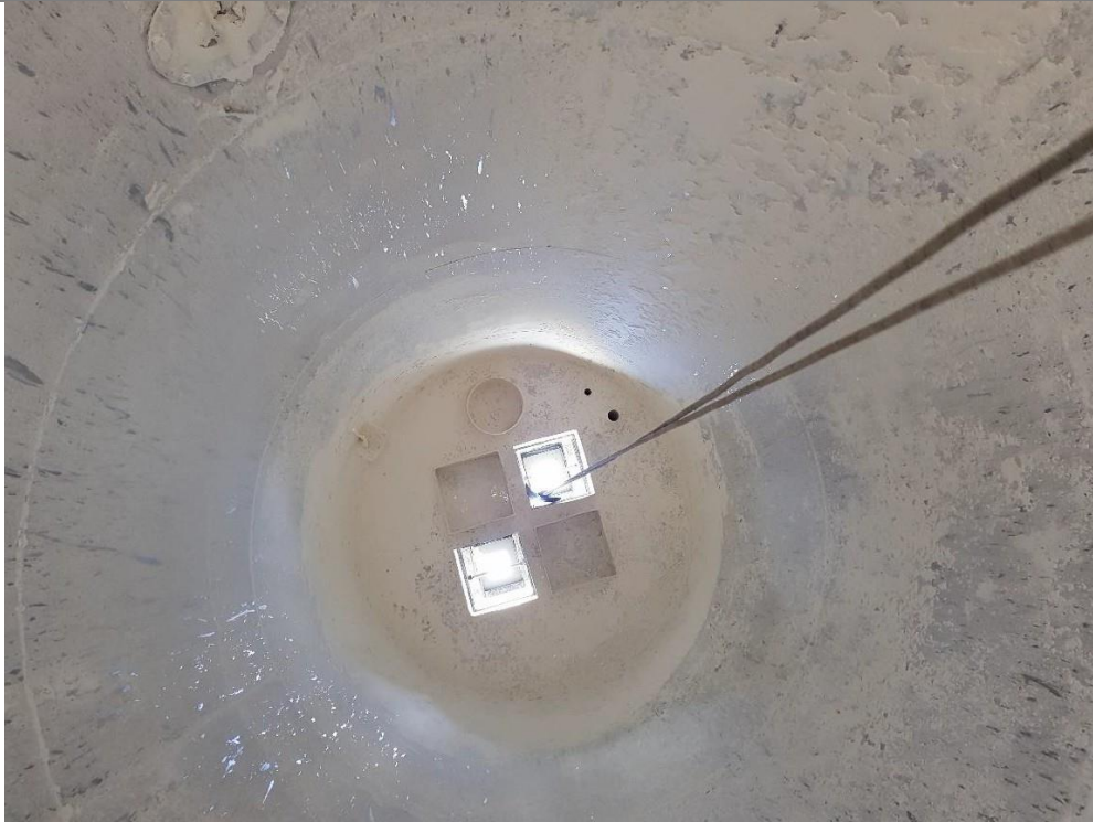
Photo No: 02 Pre-Clean: View showing accumulated deposits to the internal wall surfaces.

Photo No: 01 Pre-Clean: View showing accumulated deposits to the internal wall surfaces.