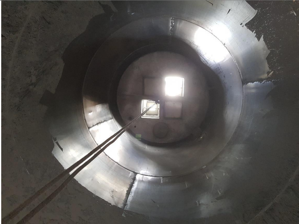
Photo No: 02 Post-Clean: View showing the cleaning works being undertaken.

Photo No: 01 Post-Clean: View showing the cleaning works being undertaken